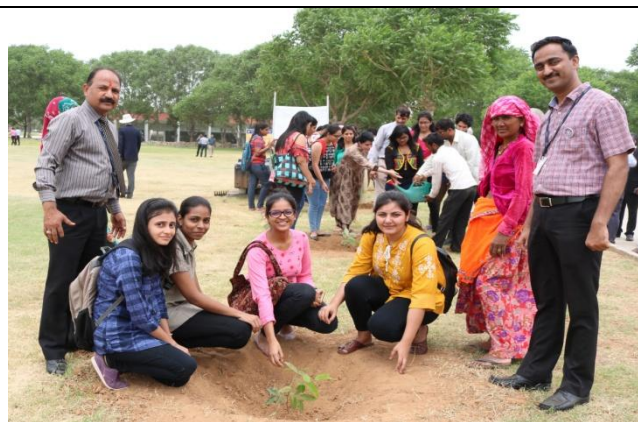
Plantation by volunteers