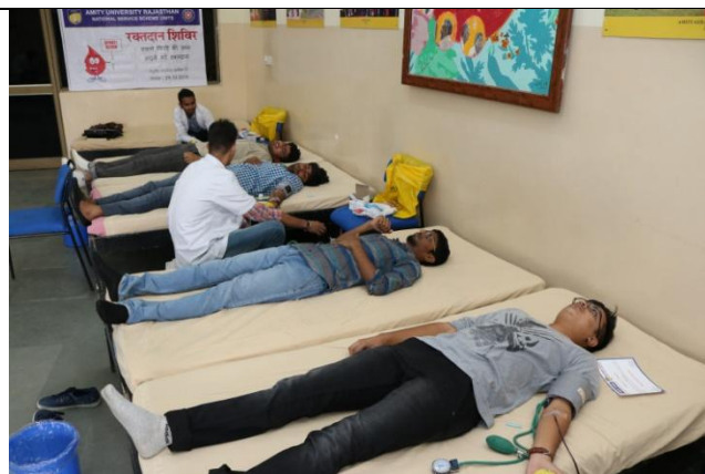
The volunteers donating blood