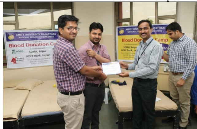
Certificate presentation to the donor