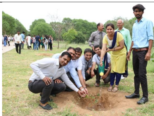
Plantation by volunteers