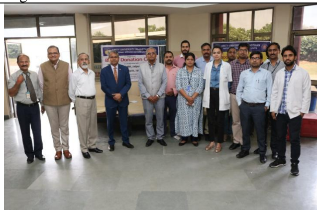
Visit of senior officials at Blood Donation Camp