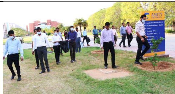
Participants started cleaning the campus