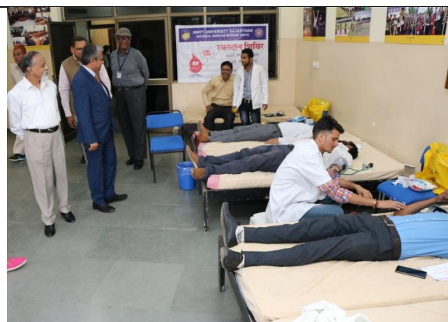
Visit of President at Blood Donation Camp