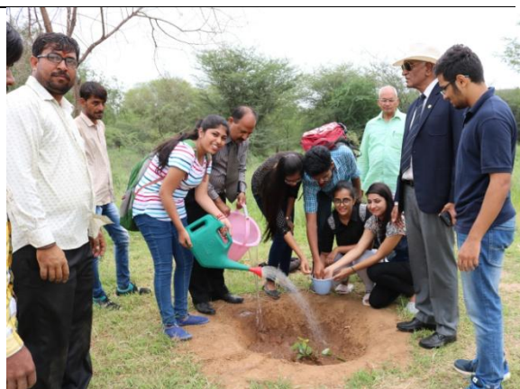
Plantation by volunteers