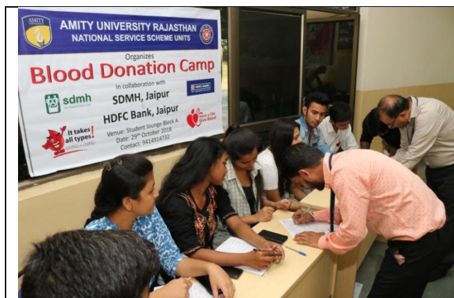
Registration for blood donation