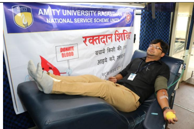
The volunteer donating blood