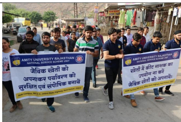
The rally proceeds