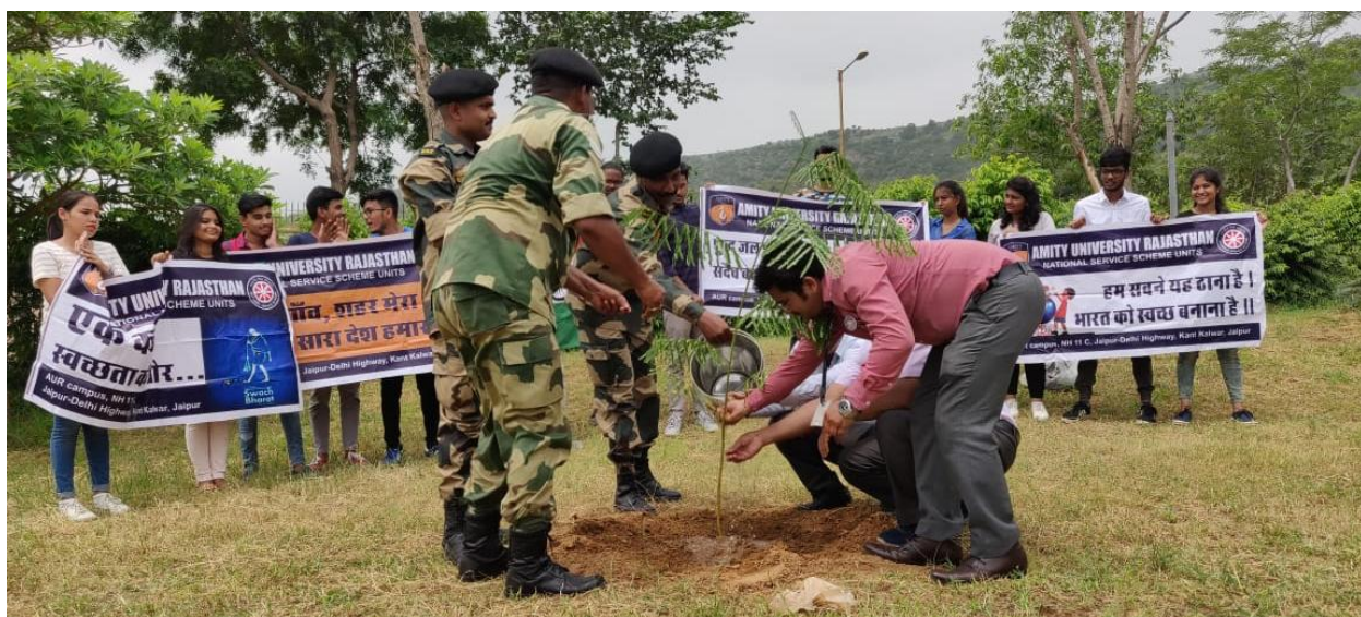
Figure 2 NSS, AUR Team during Plantation Drive