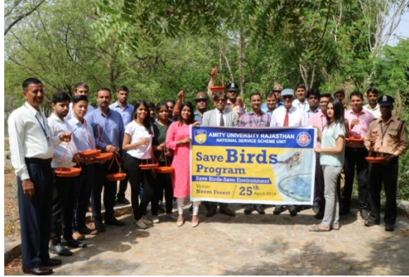
Group Photograph: Save Bird Program