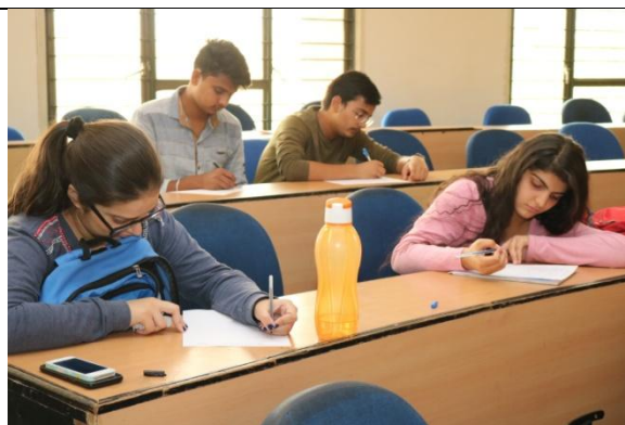
Participants writing the essay