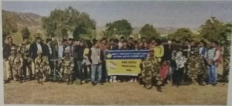
आमेर | लबाना के बीएसएफ कैंप में भ्रमण करते एमिटी विश्वविद्यालय के छात्र-छात्राएं।