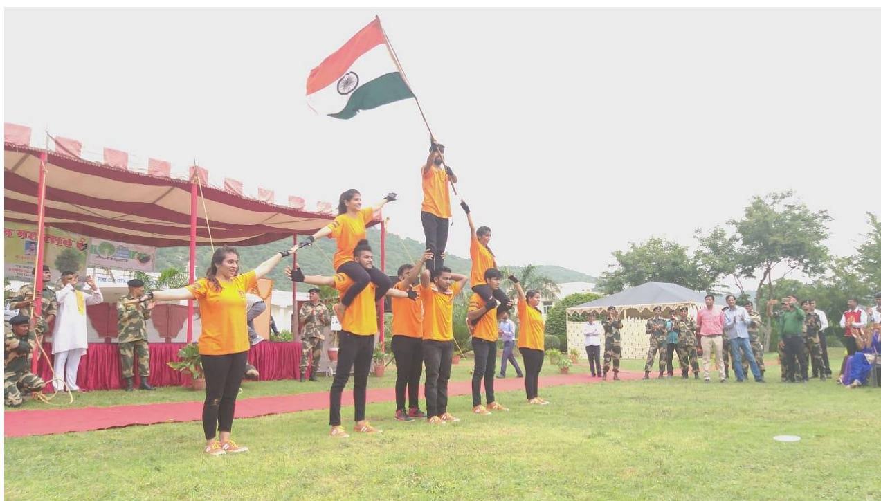
Figure 4 A Patriotic dance performance by Impulse, AUR on the occasion