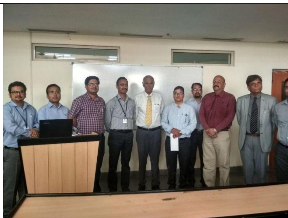
Group photograph: presentation of token of appreciation to the guest