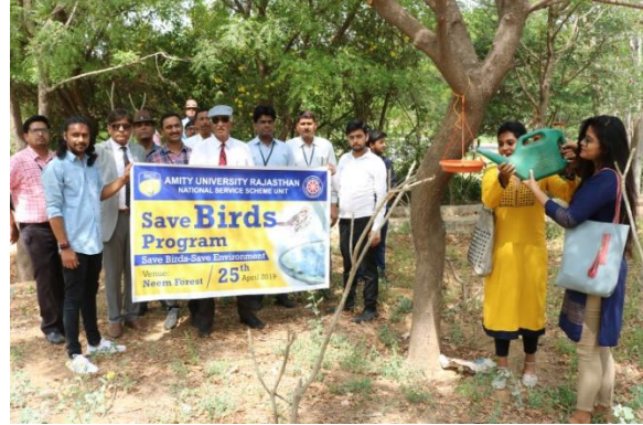
Volunteers adding water for birds