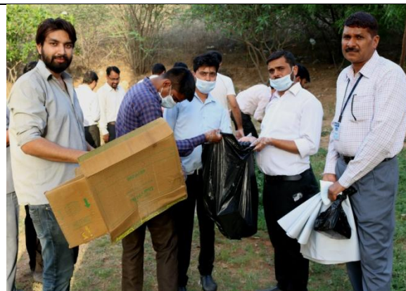
Volunteers collecting garbage