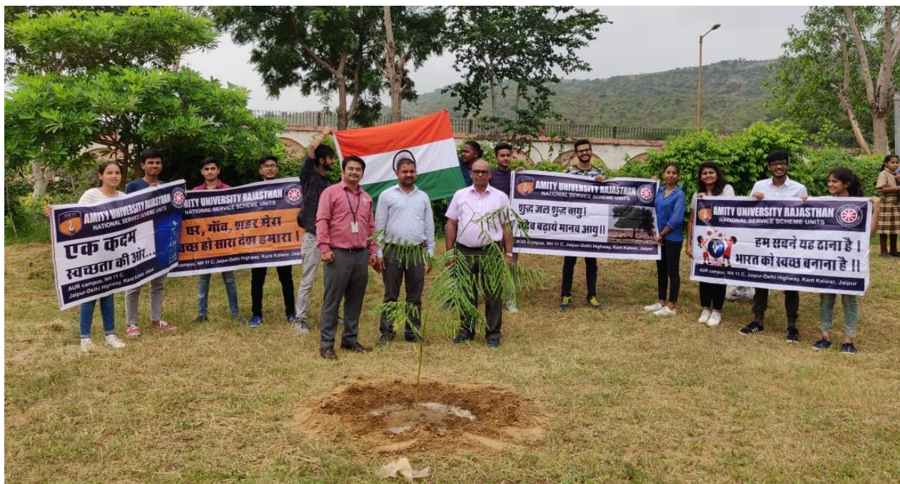
Figure 3 NSS, AUR Team during Plantation Drive