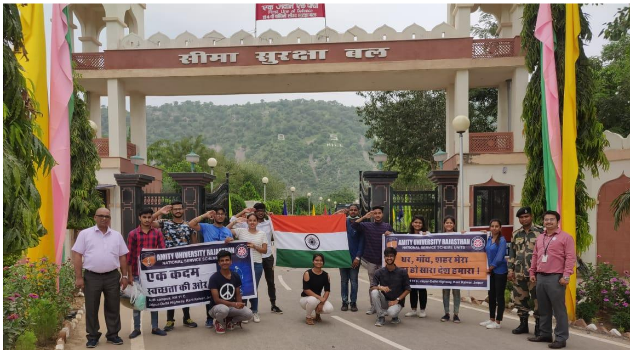
Figure 1 NSS, AUR Team at BSF Labana Jaipur Entrance gate