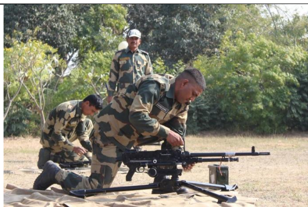
Field rehearsal by BSF jawans