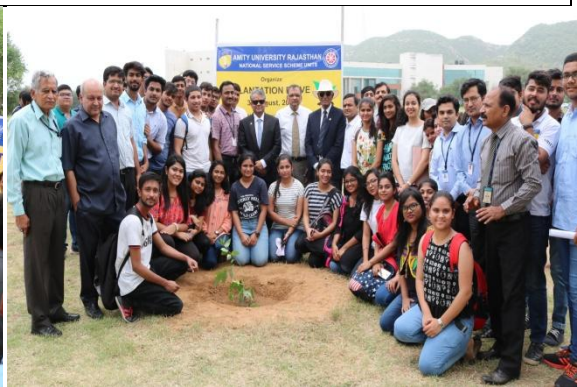
Group photographs at plantation site