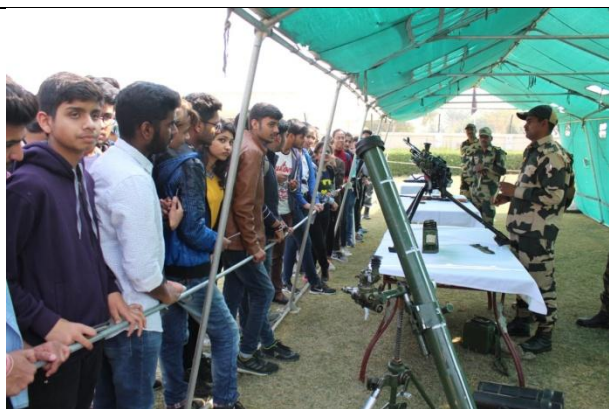
Sharing the information about weapons