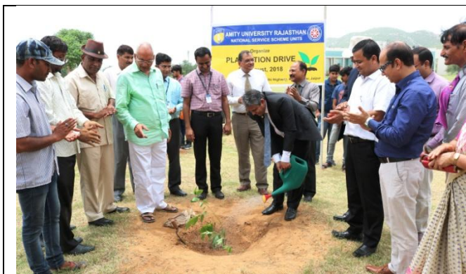
Plantation by Honorable President, AUR