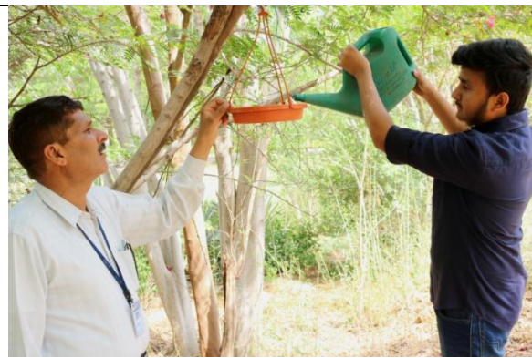
Volunteers adding water for birds