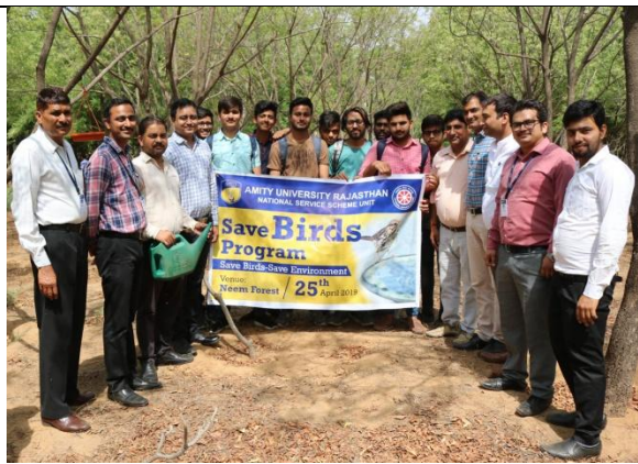
Group Photograph: Save Bird Program