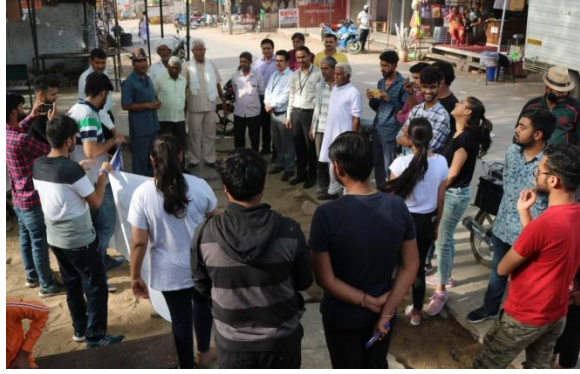
General discussion with farmers