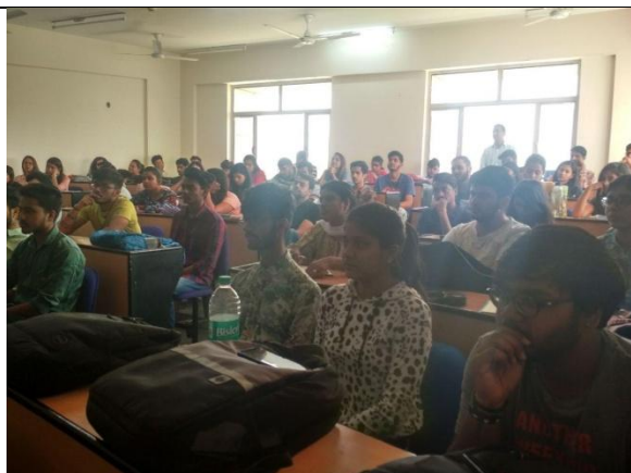
The participants listening the talk