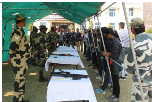
Sharing the information about weapons